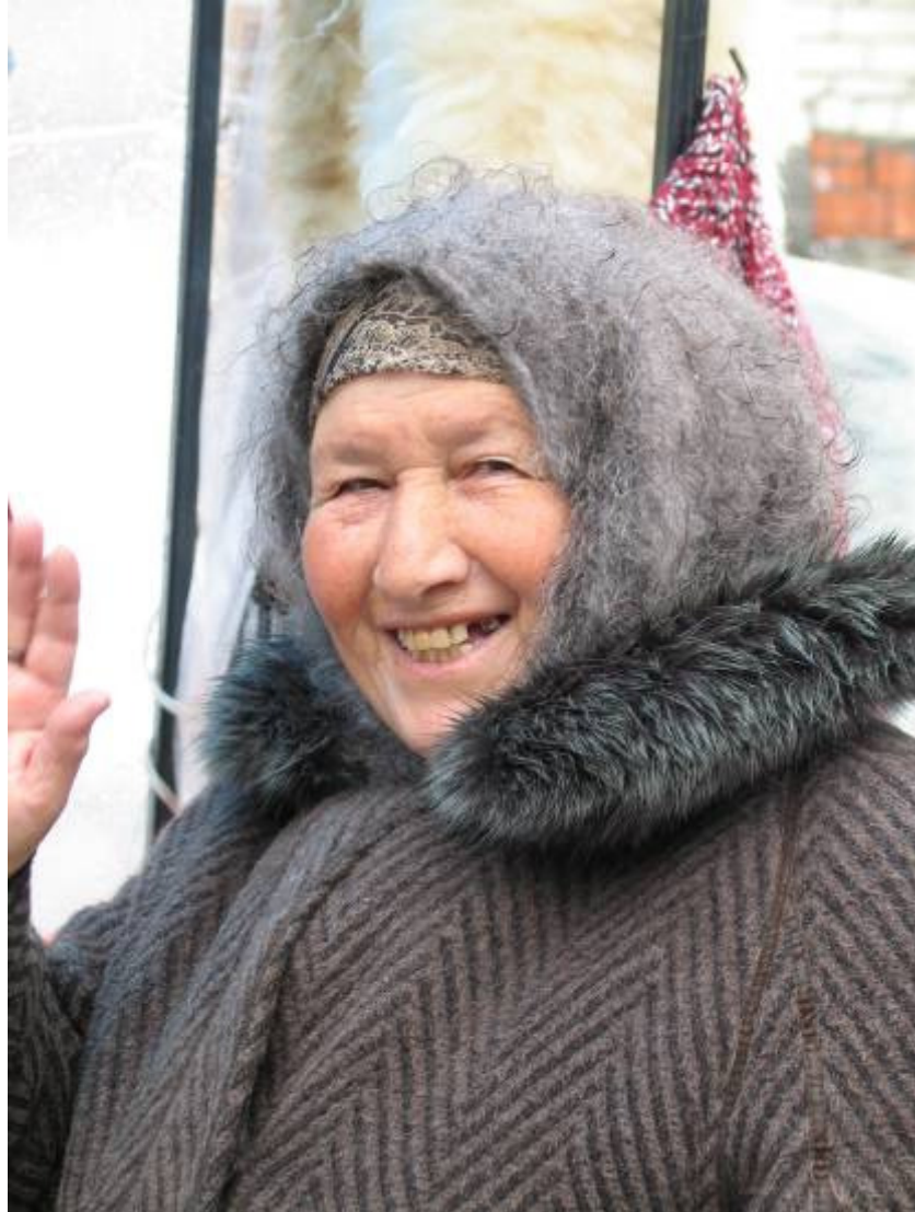
Local woman in the Russian Caucasus