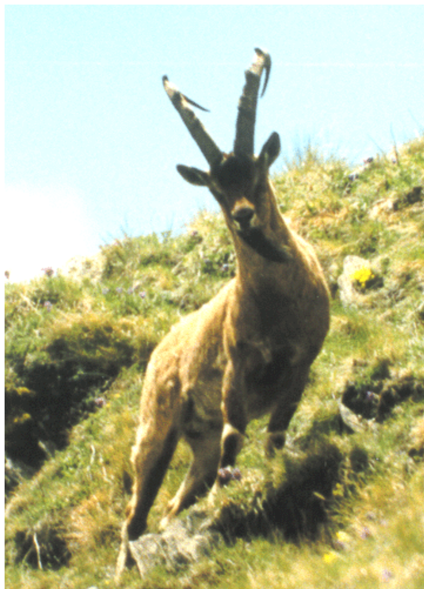
Bezoar Goat, © WWF Caucasus PO