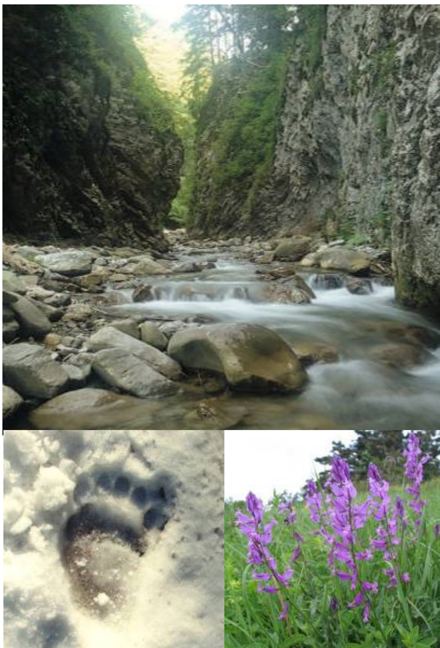
Impressions from Borjomi Kharagauli Nationalpark, Georgia