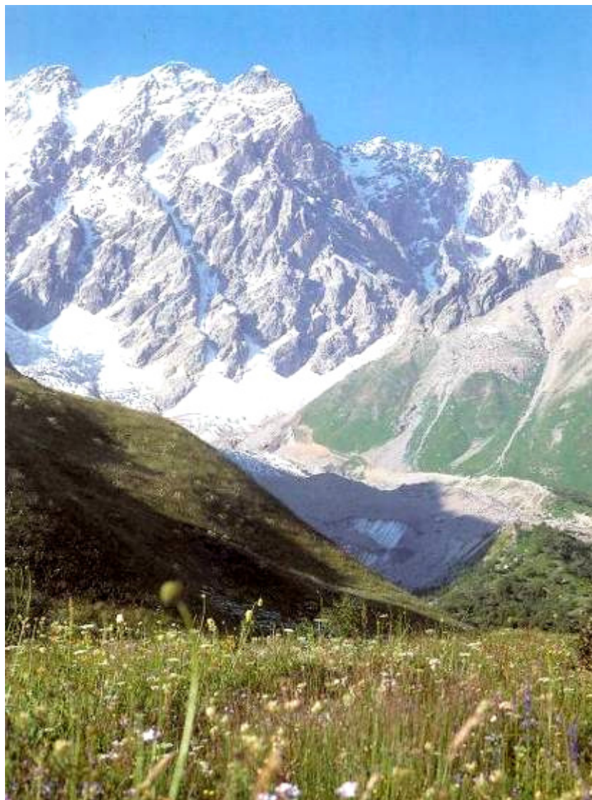
Greater Caucasus Mountains