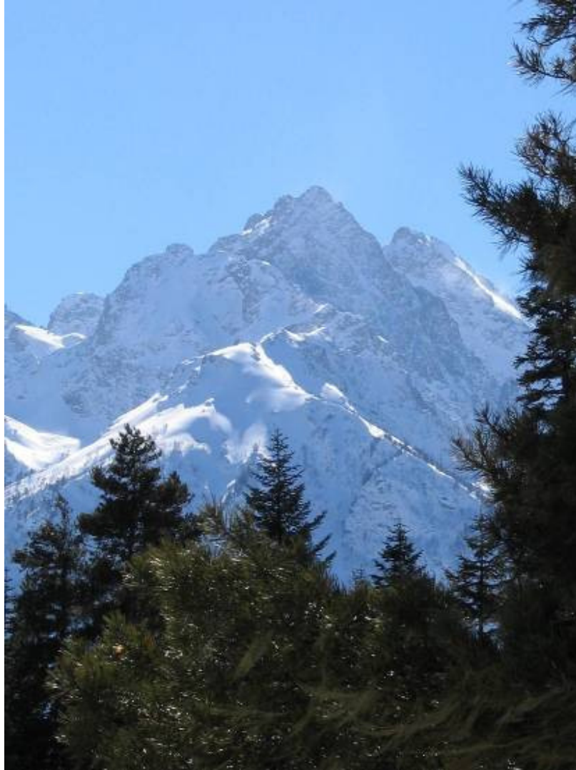
Greater Caucasus Mountains