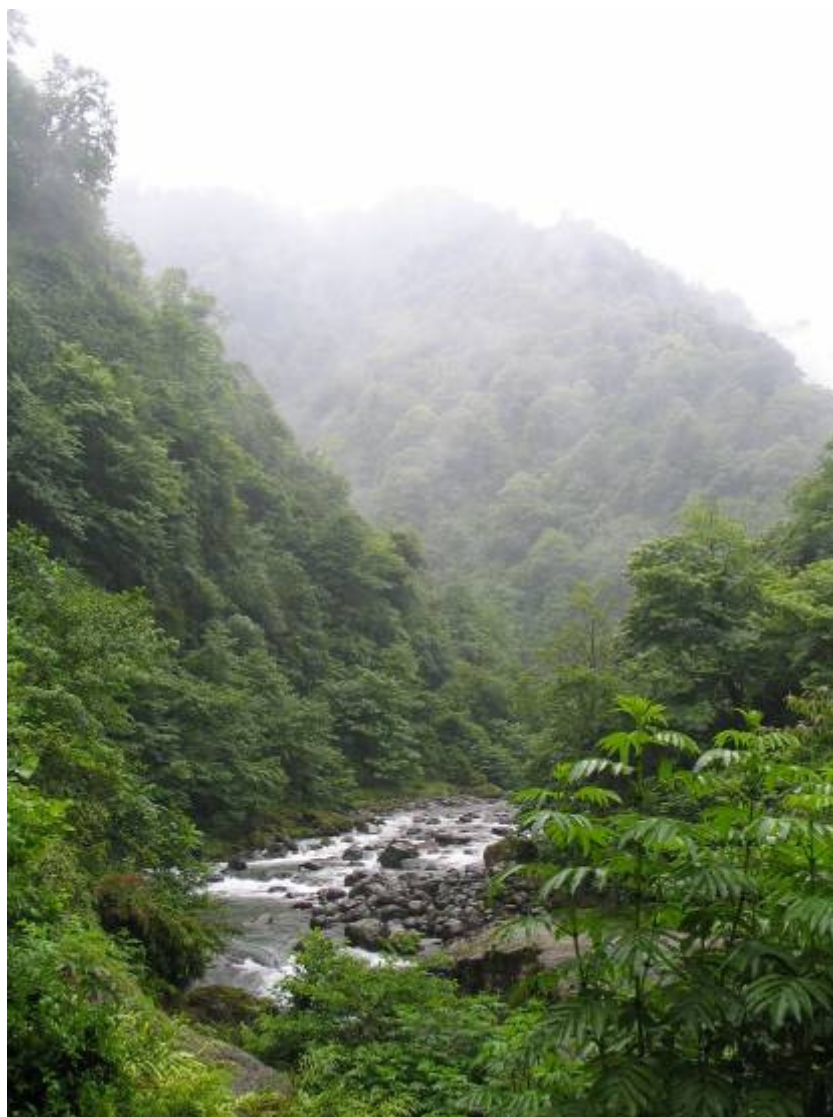
Mtskheta Nationalpark, Georgia